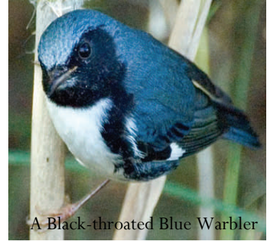
A Black-throated Blue Warbler

There were 23 birders in the field and the list of species documented as nesting was extensive. Over the three day period birders made 672 observations and documented 122 species. A highlight was the discovery on Sunday morning by Jim Dolan and Aaron Boone of nesting Black-throated Blue Warblers up in Pine Run about 100 feet across the state line in Pennsylvania. Unfortunately they can't be counted in the OBBA II this year, but perhaps next year they'll move into Ohio. Their presence is significant because the only record of