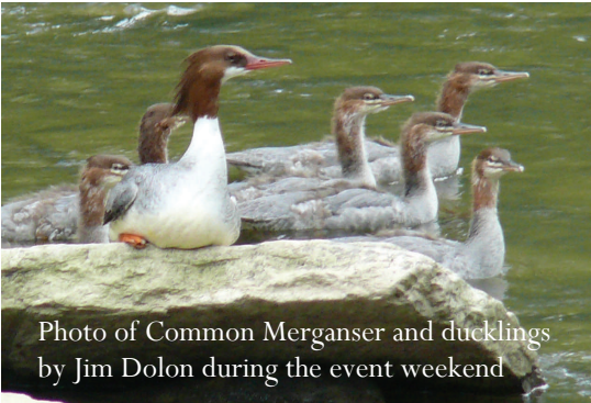
Photo of Common Merganser and ducklings during the event weekend

breeding Black-throated Blue Warblers is from the 1930's in one locality.