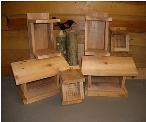
The completed bird feeders

During the summer of 2010 the Beaver Creek Wildlife Education Center (BCWEC) and Little Beaver Creek Land Foundation (LBCLF) in partnership with Beaver Creek State Park (BCSP) will be offering a ten week series of outdoor nature activities geared toward children and their families. These activities will be based on the Explore the Outdoors Activity Guide published by the Ohio Department of Natural Resources, and will include hiking, birding, fishing, and much more. The series will begin on Saturday, June 5 at 10am at the Beaver Creek Wildlife Education Center and will meet each Saturday morning at the same time and place through August 7, unless otherwise noted. Activities will be geared toward ages 6-12. Parents are encouraged to stay and participate with their children. Please see the enclosed flyer for more specific information.